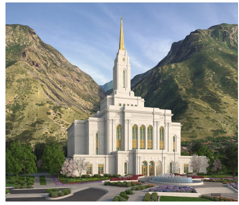
Proposed Provo Temple