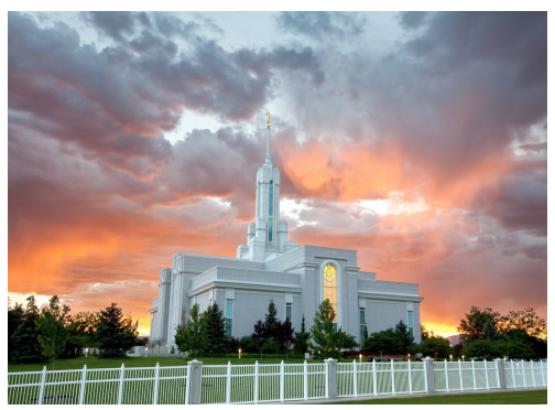
Mt. Timpanogos Temple